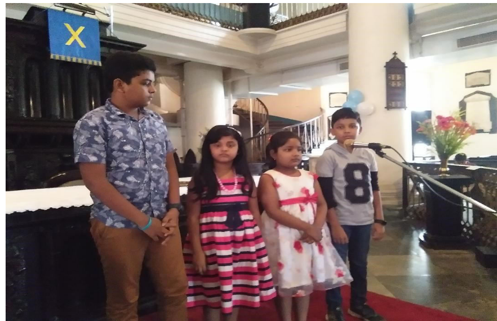
CHURCH CHILDREN AND LMB SINGING SPECIAL NUMBERS